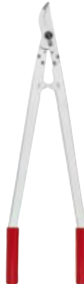
F-21 25 in. (63 cm)

Weight 40 oz. (1150 g) Bar Code 7 83929 10021 0