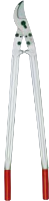
F-22 33 in. (84 cm)

Weight 72 oz. (2035 g) Bar Code 7 83929 10022 7