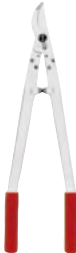
F-23 21 in. (53 cm)

Weight 36 oz. (1010 g) Bar Code 7 83929 10023 4