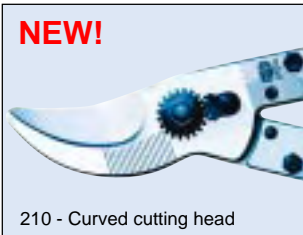
210 - Curved cutting head

Also available with NEW Curved Cutting Head. Has a more 'Slicing Effect'. Reduces effort on Larger Branches.