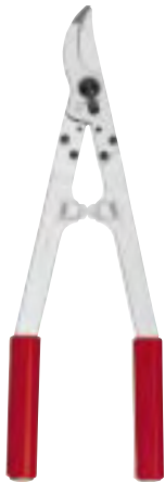
F-20 17 in. (43 cm)

Weight 27 oz. (790 g) Bar Code 7 83929 10020 3