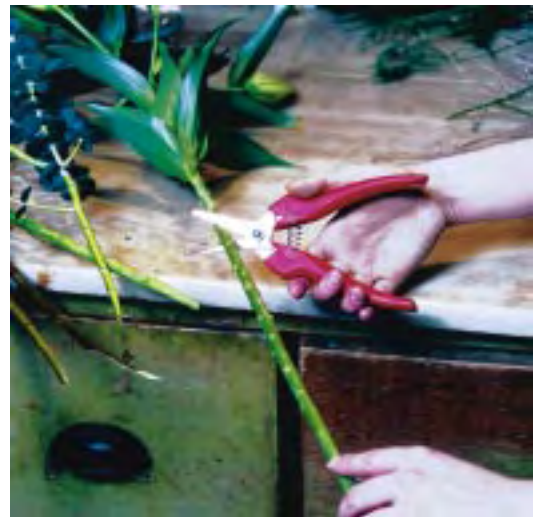
F-310 Bar Code 7 839291 10038 8