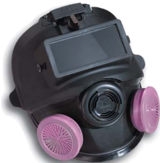
54001W FULL FACEPIECE SHOWN WITH 7580P100 FILTERS

The North Full Facepiece Welding Respirators have a welding shield constructed of a fire resistant thermoplastic material, that can be lifted upward on a locking hinge for a wide-angle view of the work area. It is available as a complete respirator or as an attachment, to convert your existing North 7600 Series or 5400 Series Full Facepiece.