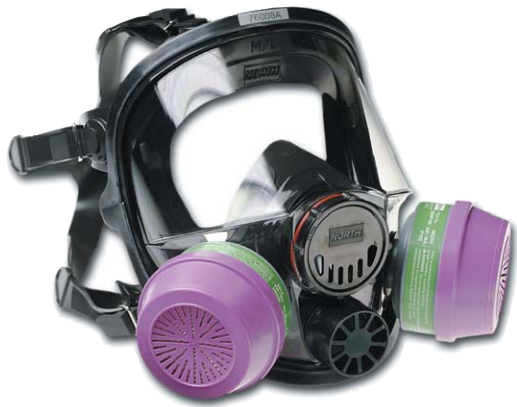
760008A FULL FACEPIECE SHOWN WITH 7584P100 CARTRIDGES

The 7600 Series Full Facepiece respirators are designed to provide eye, face and respiratory protection while ensuring optimal comfort and performance. Its dual flange silicone seal gives this facepiece superior fitting characteristics. The hard-coated polycarbonate lens provides over 200° field of vision and protects the wearer's eyes and face against irritating gases, vapors and flying particles. The lens also provides excellent optics, is scratch resistant and meets ANSI standards for impact and penetration resistance. The 7600 Series Full Facepiece sets the standard for full facepiece protection.