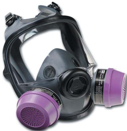
54001 FULL FACEPIECE SHOWN WITH 7581P100 CARTRIDGES

The 5400 Series provides the comfort and protection you would expect from North, at an unbeatable price. No other full facepiece in its price range offers such quality, engineering and attention to detail. Weighing only 14 ounces, the 5400's lightweight design offers a level of comfort that ensures greater worker acceptance. Plus, its facepiece seal is made from a soft, pliable elastomer material with high chemical resistance to assure excellent comfort, fit and performance.