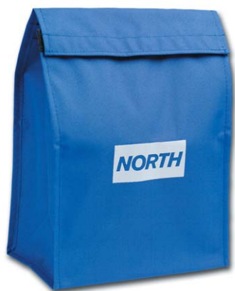
76BAG FOR FULL FACEPIECE