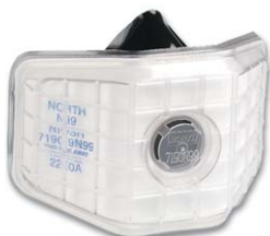
7190N99 PARTICULATE RESPIRATOR

For solids, such as welding fumes and non-oil particulates (99% minimum filter efficiency). Fits easily under welding hoods. Replacement filters available.