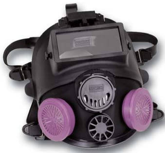
760008AW FULL FACEPIECE SHOWN WITH 7580P100 FILTERS