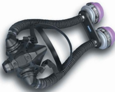
BP1002 SHOWN WITH 7700 SERIES HALF MASK AND 7581P100 CARTRIDGES

The backpack adapter allows users to locate cartridges and filters out of the work zone, by placing them on the user's back. The BP1002 is easily adaptable to all North Full Facepiece and Half Mask air-purifying respirators, simply by attaching it to the facepiece cartridge connectors. It is ideal for tight or highly heated work places such as those encountered in welding operations. Think of it as an extension cord for your cartridges.