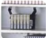
bookend dividers keep media neatly in place