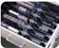
inside multi-media cabinet drawer (model 4928 or 4930)