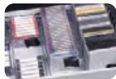
inside audio video cabinet drawer (model 4935)