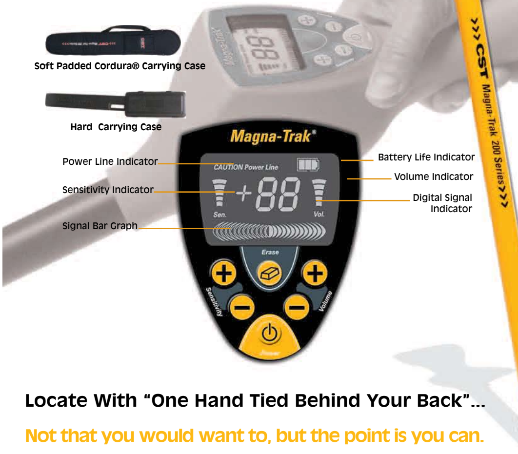
Soft Padded Cordura ® Carrying Case