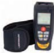
58-TLM200 True Laser Measurer- Professional Includes: Carrying case, 2 AAA batteries, instruction card