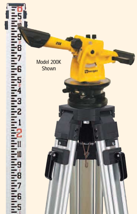
Model 200K Shown