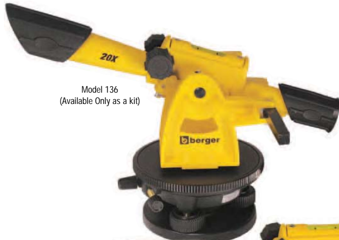
Model 136 (Available Only as a kit)