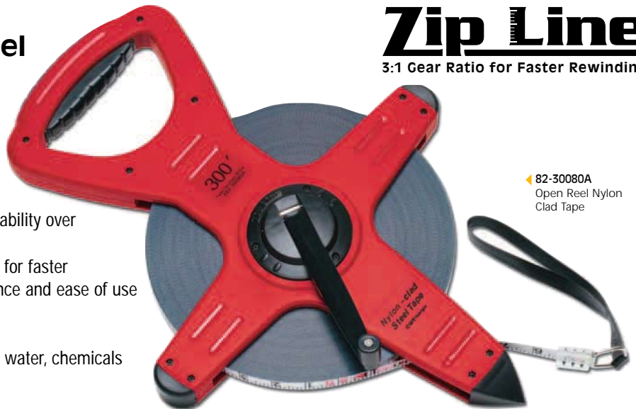
82-30080A Open Reel Nylon Clad Tape

Zip Line™ 3:1 Gear Ratio for Faster Rewinding