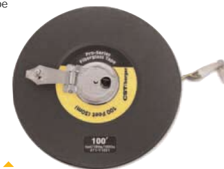
71-Y1001 Closed Reel Fiberglass Tape