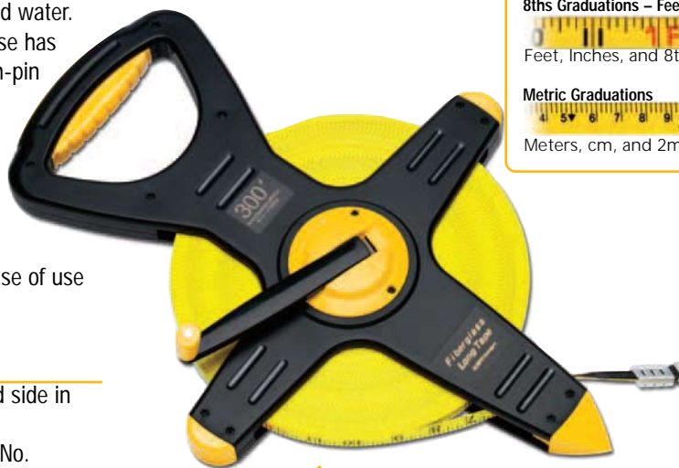
74-Y3008 Open Reel Fiberglass Tape

Zip Line 3:1 Gear Ratio for Faster Rewinding