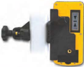
LD400 and LD120 is Equipped with Dual Sided LCD Display (Back View)