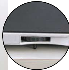
Adjustable leveling feet