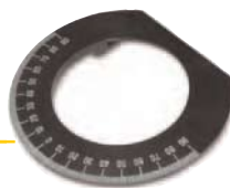
GizmoLite 3 Shown with LaserPole

57-90DC 90° Graduated Circle for Gizmo Lite